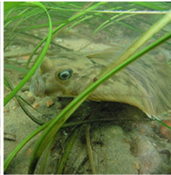
Submerged Aquatic Vegetation