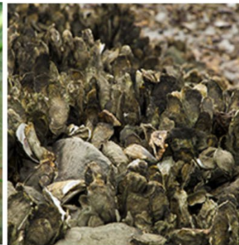
Marine & Estuarine Shellfish Beds