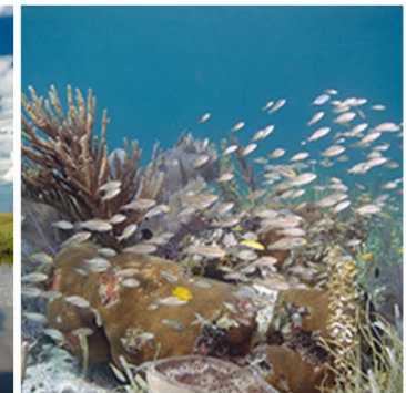
Coral and Live/Hard Bottom